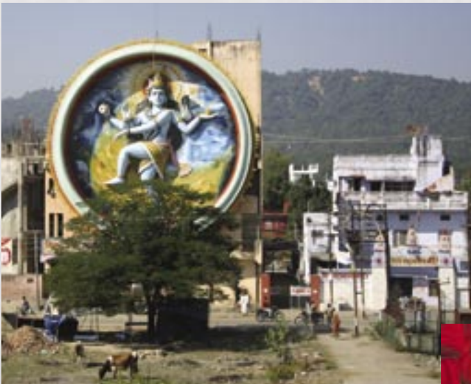
Lord Shiva relief sculpture in Haridwar