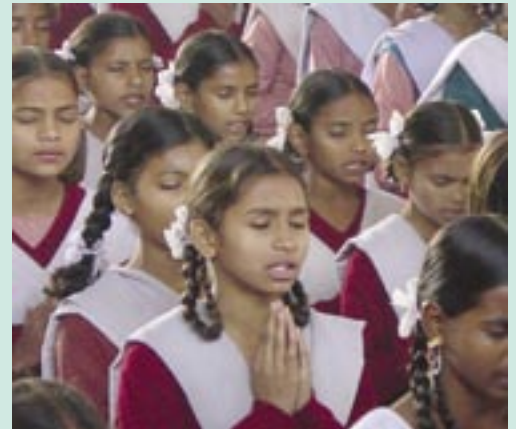
Children of Mawai perform morning prayers and songs for us.