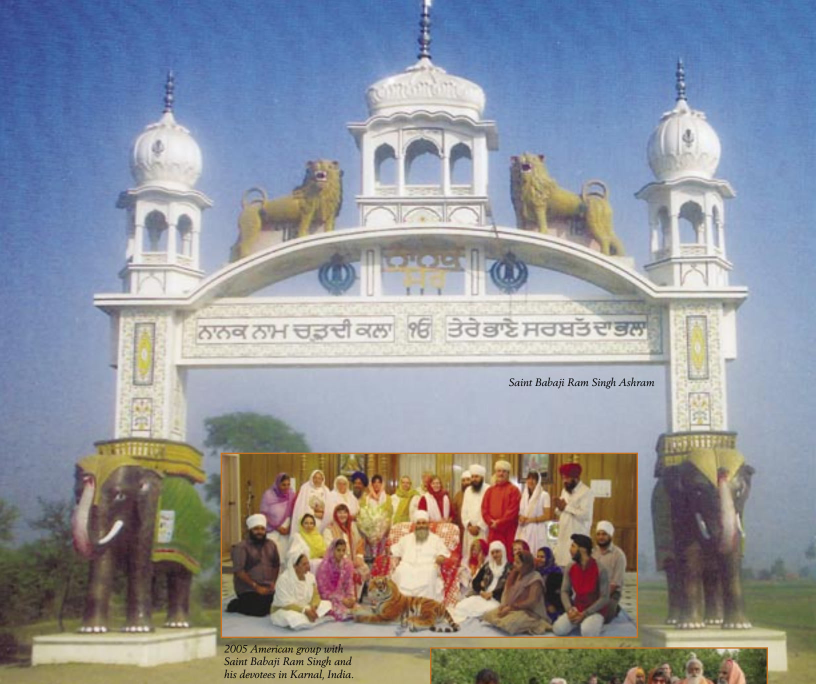
Saint Babaji Ram Singh Ashram