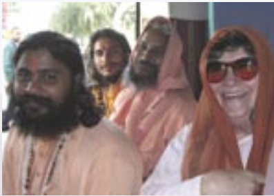
Sallyji with spiritual sons