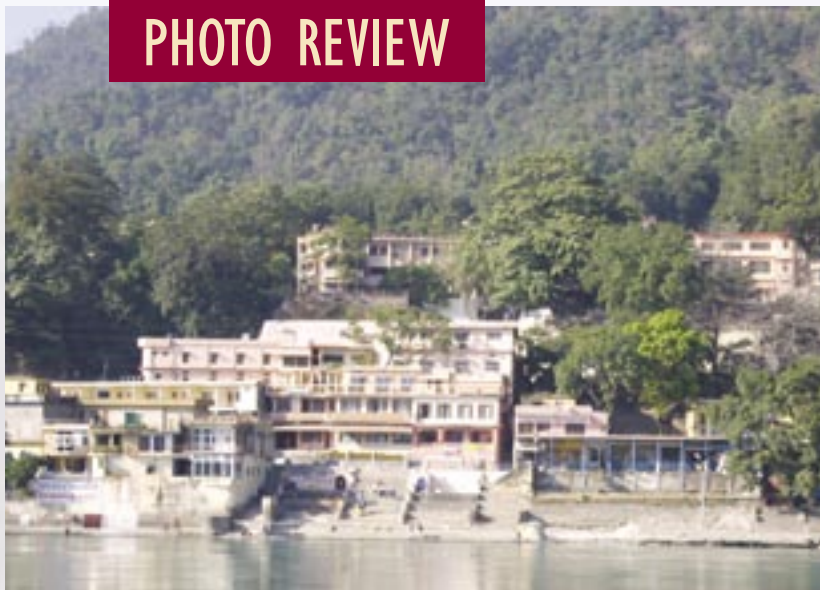
Haridwar is known as "The Gateway to Heaven." In this photo is Risheski, 30 minutes from Haridwar, the holy place where the Beatles received their spiritual guidance.