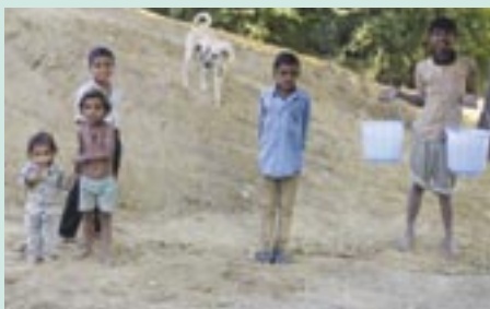
Children in Swami's village of Mawai