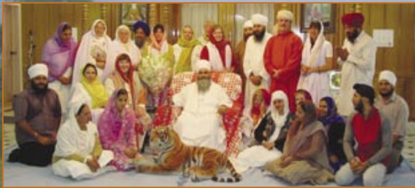
2005 American group with Saint Babaji Ram Singh and his devotees in Karnal, India.