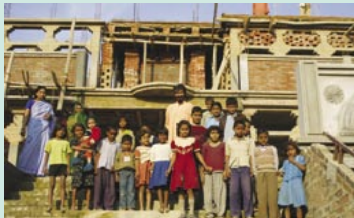
Temple being built on Swami's birth site home in village of Mawai Dham.