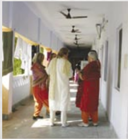
Americans in discussions at the ashram of Akhand Param Dham Haridwar.