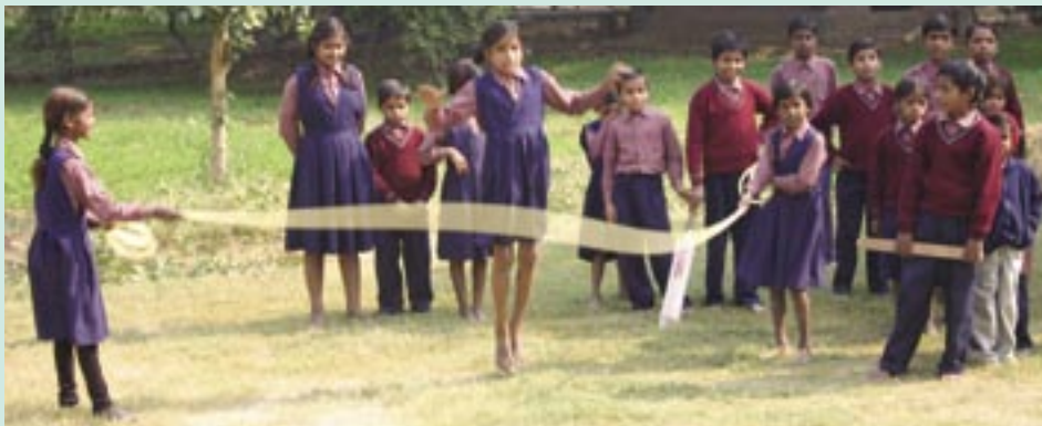
Children at Vatsalya Gram jumping rope.