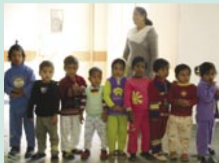
“Vatsalya Gram” means “Home of Maternal Love,” teacher and school children